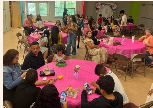
The men and youth served a wonderful Mother's Day lunch to approximately 30 moms at Dulce Refugio Church.