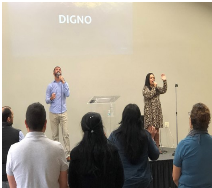
Dulce Refugio Worship Service