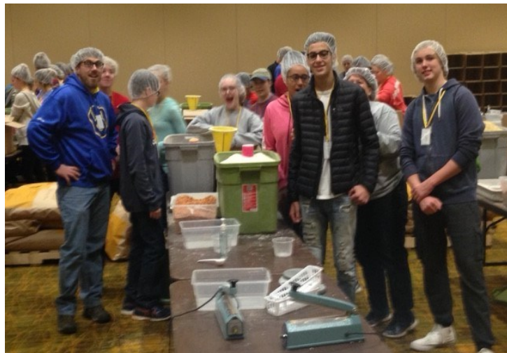
Youth at Districts