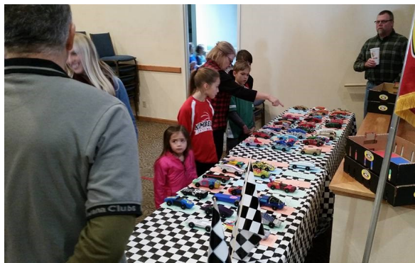
AWANA Grand Prix